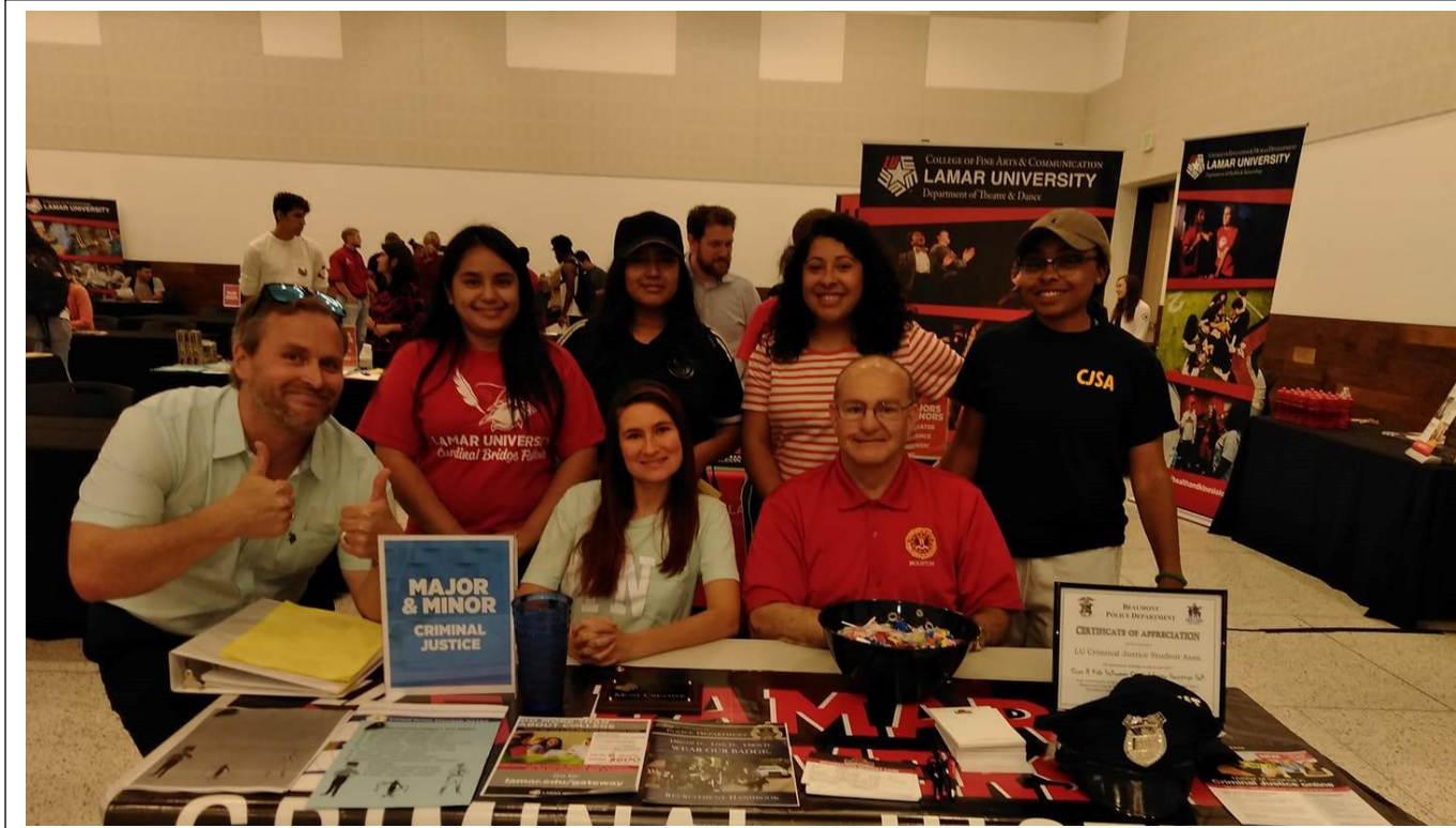
Criminal Justice Faculty and Students had a great time on October 4 th at Majors, Minors, and More!