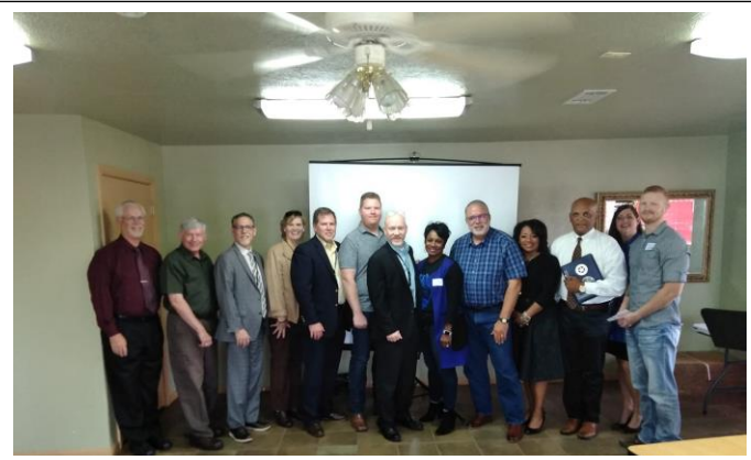
Spring and Fall 2018 Criminal Justice Advisory Board meetings bring Lamar criminal justice faculty and students close to the local community leaders as they exchange ideas for a meaningful partnership (Above). Criminal Justice faculty and students enjoying the spring air (below).