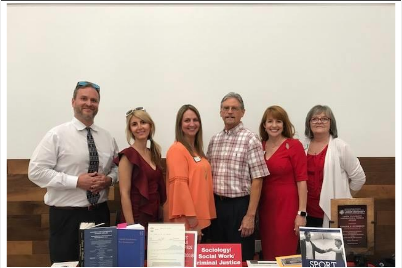
The Lamar Criminal Justice Faculty showcased their books and their 2018 peer-reviewed publications at the First Annual Lamar University Research Expo!