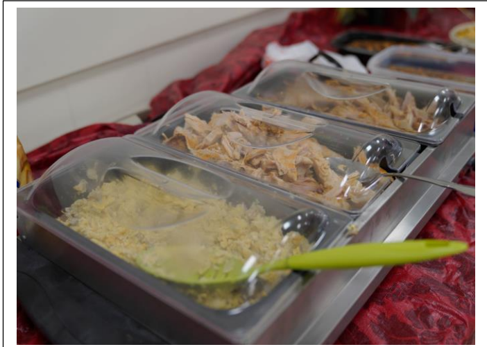
Fun times at the Christmas party of the Department of Sociology, Social Work, and Criminal Justice on December 5 th . All the faculty members cooked delicious dishes for the merry occasion!!